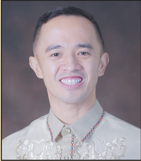
HON. DE CARLO L. UY, MBA (Vice Governor) Acting Governor